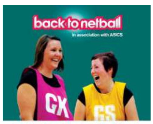
Get fit, have fun, make friends

A brand new coaching bursary has been introduced by Active Surrey to support the development of coaches who would like to be involved in delivering Back to Netball sessions. This bursary will assist with the cost of attending a UKCC Level 1 or Level 2 coaching course. If you are currently a Back to Netball attendee, a club player that would like to help increase their club's membership or an individual that is keen to get involved in netball coaching, then this bursary is available to support your development.