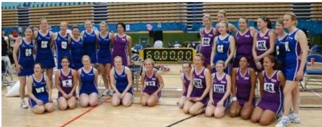
Claygate and New Malden Netball Club members after achieving the World Record

some might be a little less enthusiastic now! Looking back it was the most incredible example of teamwork that I have ever seen – not just from the 24 players involved but from